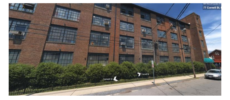
The Shirt Factory